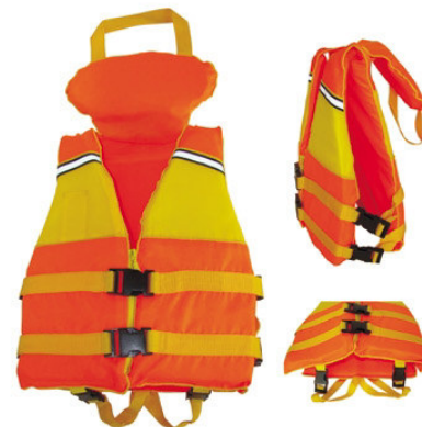
SS6522 • Polyester 210 Denier coating • EPE foam inserts