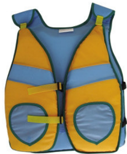
SS6502 • Polyester 210 Denier coating • EPE foam inserts