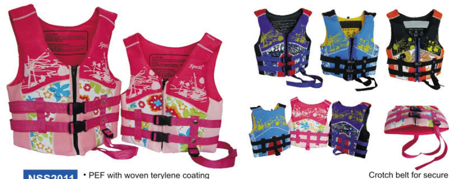
NSS2011 • PEF with woven terylene coating • EPE foam inserts • Attractive printing