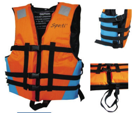
SS6540 • Oxford 420 Denier coating • EPE foam inserts