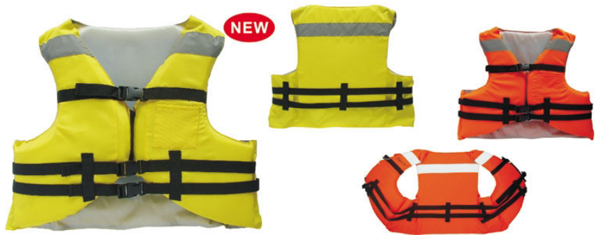
SS6559 • Polyester 300 Denier with PU coating • EPE foam inserts