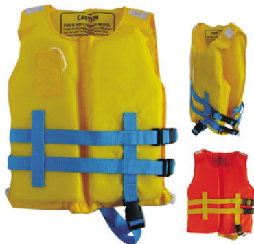
SS6521 • Polyester 210 Denier coating • EPE foam inserts