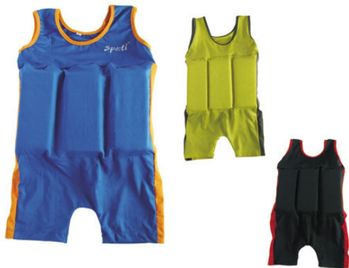
SS6509A • Lycra coating • EPE foam inserts