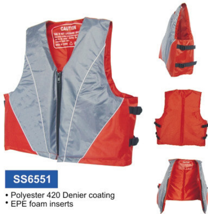
SS6551 • Polyester 420 Denier coating • EPE foam inserts