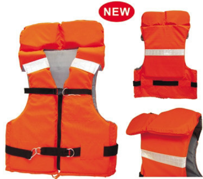
SS6561 • Polyester 300 Denier with PU coating • EPE foam inserts