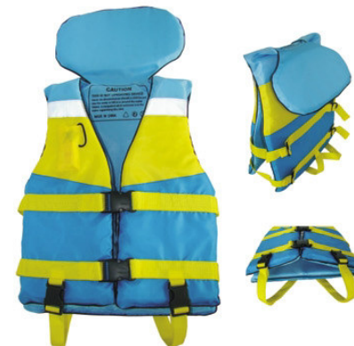
SS6554 • Polyester 210 Denier coating • EPE foam inserts