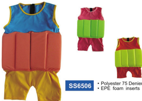
SS6506 • Polyester 75 Denier coating • EPE foam inserts