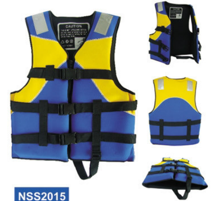
NSS2015 • PEF coating • EPE foam inserts