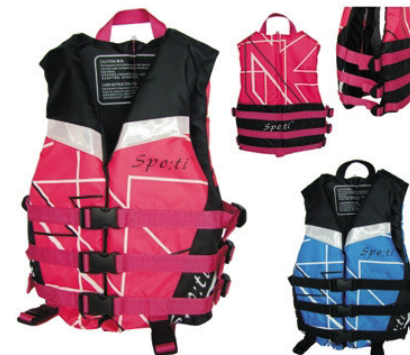
SS6568B • Polyester 420 Denier coating • EPE foam inserts • Customized printing available