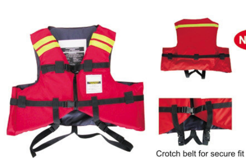
SS6562 • Polyester 300 Denier with PU coating • EPE foam inserts