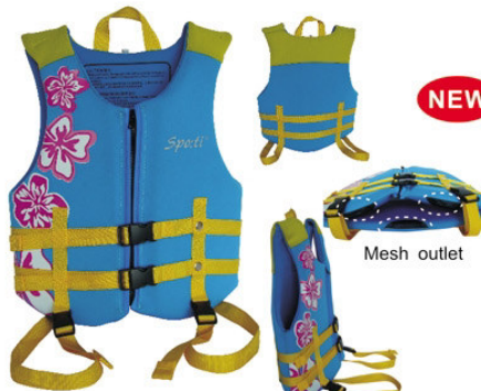
NSS2022 • Neoprene coating • EPE foam inserts • Customized printing available