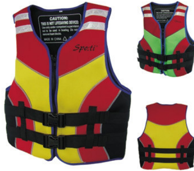
NSS2017 • PEF coating • EPE foam inserts