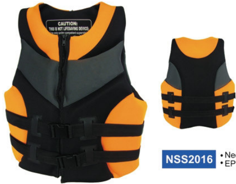
NSS2016 • Neoprene coating • EPE foam inserts