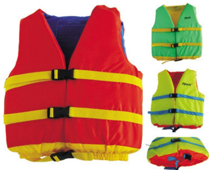
SS6500 • Polyester 210 Denier coating • EPE foam inserts