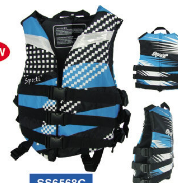
SS6568C • Polyester 420 Denier coating • EPE foam inserts • Customized printing available