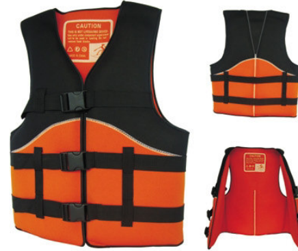
NSS2006 • PEF coating • EPE foam inserts