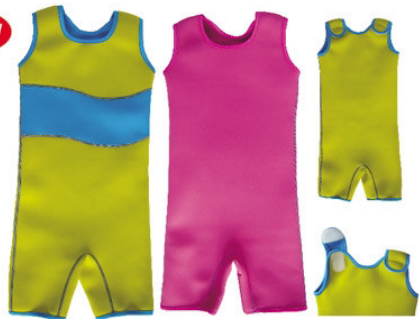
SS6512 • Neoprene diving wetsuit