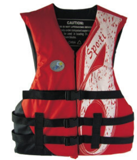
SS6556 • Oxford 420 Denier coating • EPE foam inserts • Attractive printing