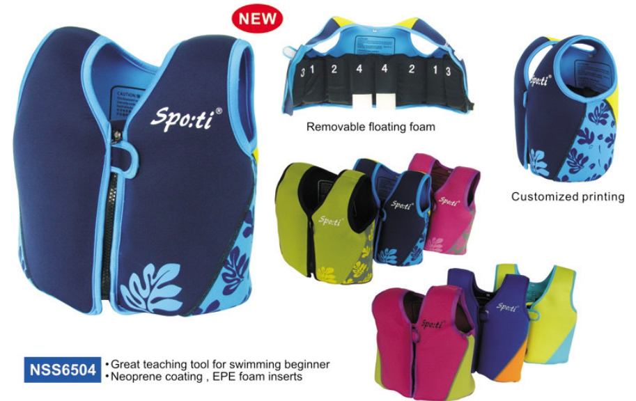
NSS6504 • Great teaching tool for swimming beginner • Neoprene coating , EPE foam inserts

Security and comfort, enable swimmers to enjoy fun in water Approved materials with colorful and attractive design Closed-cell EPE foam inserts to help balance and precise fit Adequate buoyancy to help build swimming confidence in water Multiple sizes available for children and adult Whistle is available