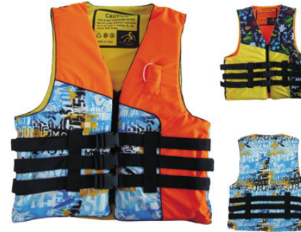
SS6547 • Woven terylene coating • EPE foam inserts