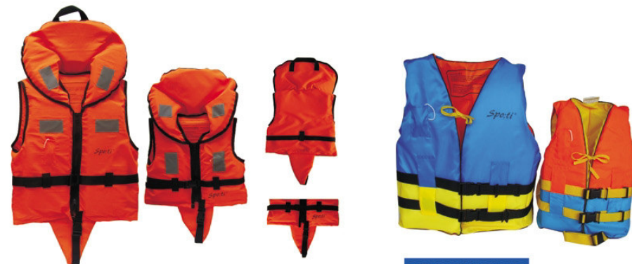
SS6535/SS6534 • Woven terylene coating • EPE foam inserts