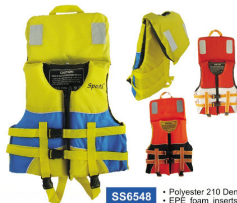
SS6548 • Polyester 210 Denier coating • EPE foam inserts