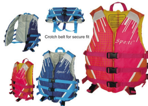
• Polyester 420 Denier coating • EPE foam inserts • Customized printing available