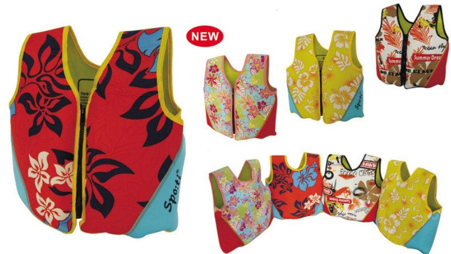
NSS6504P • Great teaching tool for swimming beginner • Neoprene or PEF with woven terylene coating , EPE foam inserts • Removable floating foam