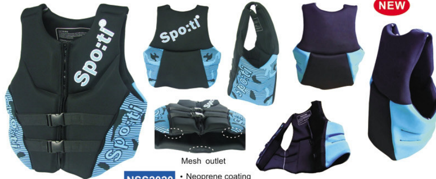
NSS2020 • Neoprene coating • Block EPE foam inserts • Customized printing available