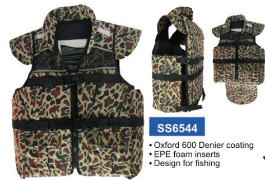
SS6544 • Oxford 600 Denier coating • EPE foam inserts • Design for fishing