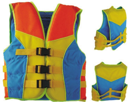
SS6537 • Polyester 210 Denier coating, • EPE foam inserts