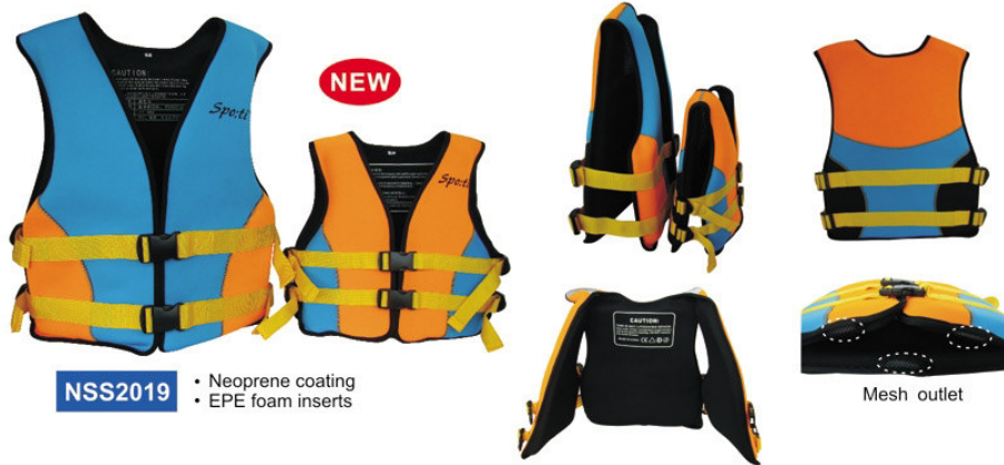
NSS2019 • Neoprene coating • EPE foam inserts