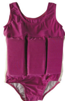
SS6509B • Lycra coating • EPE foam inserts