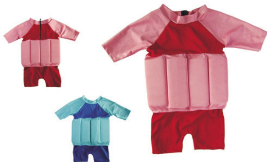
SS6507 • Lycra coating • EPE foam inserts