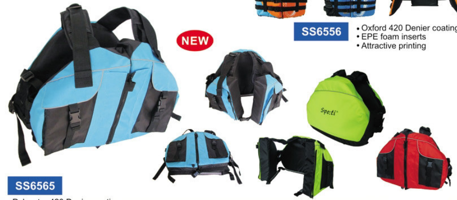
SS6565 • Polyester 420 Denier coating • EPE foam inserts