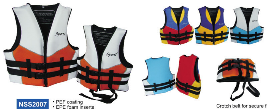
NSS2007 • PEF coating • EPE foam inserts