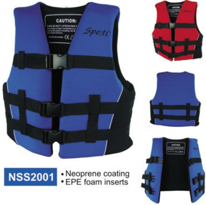
NSS2001 • Neoprene coating • EPE foam inserts