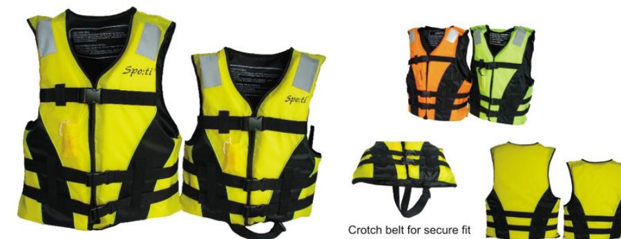
SS6546 • Polyester 210 Denier coating • EPE foam inserts