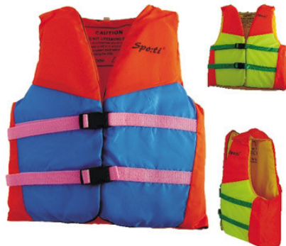
SS6501 • Polyester 210 Denier coating • EPE foam inserts