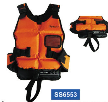
SS6553 • Oxford 420 Denier coating • EPE foam inserts