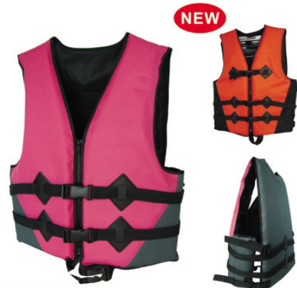
SS6566 • Oxford 600 Denier coating • EPE foam inserts