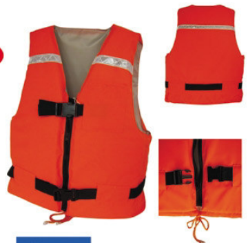
SS6560 • Polyester 300 Denier with PU coating • EPE foam inserts