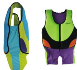
NSS2009 • PEF with polyester 75 Denier coating • EPE foam inserts