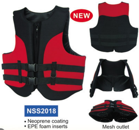
NSS2018 • Neoprene coating • EPE foam inserts Mesh outlet