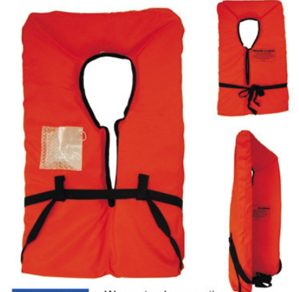
SS6564 • Woven terylene coating • EPE foam inserts